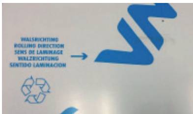
The Rolling Direction arrow indicated on the VMZINC

VMZINC applies phosphates crystals on the zinc surface to pre-weather the zinc to the various surface colors. Crystals reflect light in a specific pattern and the appearance of pre-weathered zinc is directional. This means that two identical zinc samples will look differently if they are not oriented the same. VMZINC has placed arrows labeled “Rolling Direction” on the protective film to help orient the zinc. It does not matter which direction the zinc is oriented, but it is important to choose a direction then maintain that direction until the continuous zinc elevation plane is completed to avoid color variation.