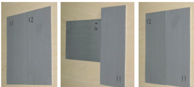
Zinc in same Orientation